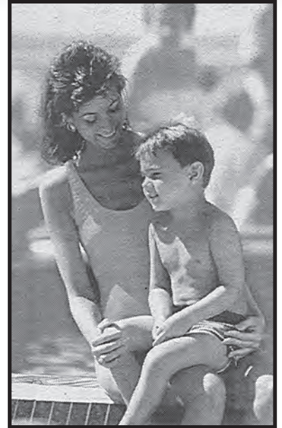
Weekends are made for families... especially by the three pools on Carnival Cruise Lines' Holiday .